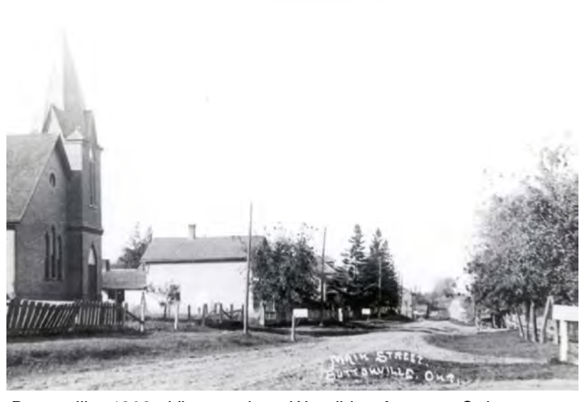
Buttonville -1909. View north on Woodbine Avenue. Only some foundations remain of the Lutheran Church on the left. Casella #24

These documents are complementary, and they are to be considered as a whole interpreting the Plan.