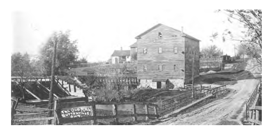
Venice Grist Mill, on the north bank of the River, and the dam. Buttonville's origins are tied to the mills and the river that powered them. Casella #23

construction so that they will, when realized, add to and not detract from, the character of the district.