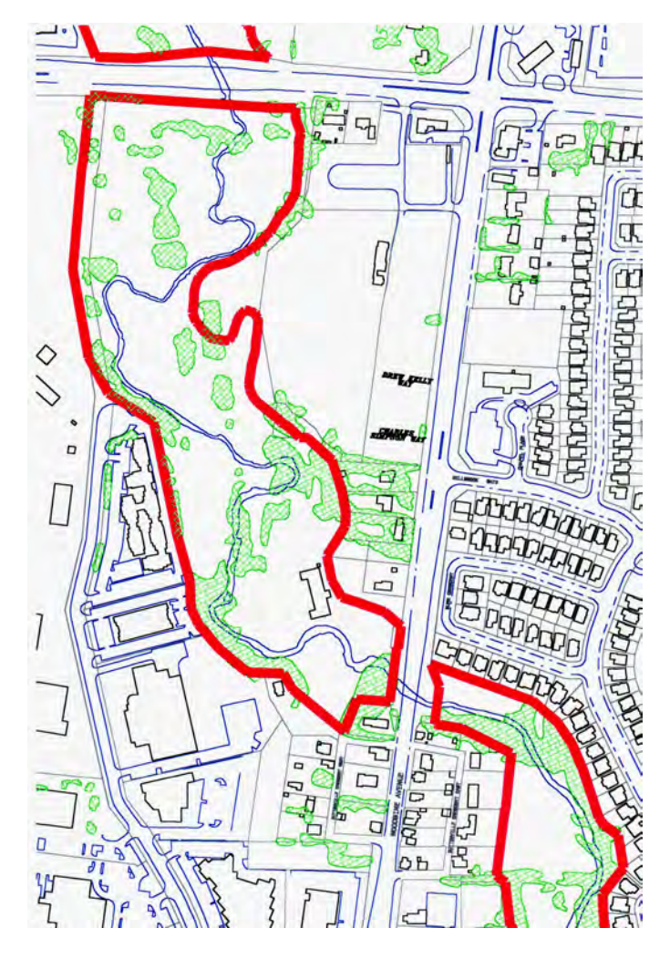
The Rouge River valley and the woodlands define the setting of the hamlet.

The Buttonville Heritage Conservation District Study and Boundary was received and endorsed by Markham Council on January 31, 2006. The boundaries of the Buttonville Heritage Conservation District as recommended by the consultant team and Town staff were approved, and authorization was given to proceed with the preparation of the Heritage Conservation District Plan on the basis of these boundaries. Significant heritage properties in the northern portion of the study area not included in the Heritage Conservation District Boundaries were subsequently individually designated under Part IV of the Ontario Heritage Act to ensure their long-term protection.