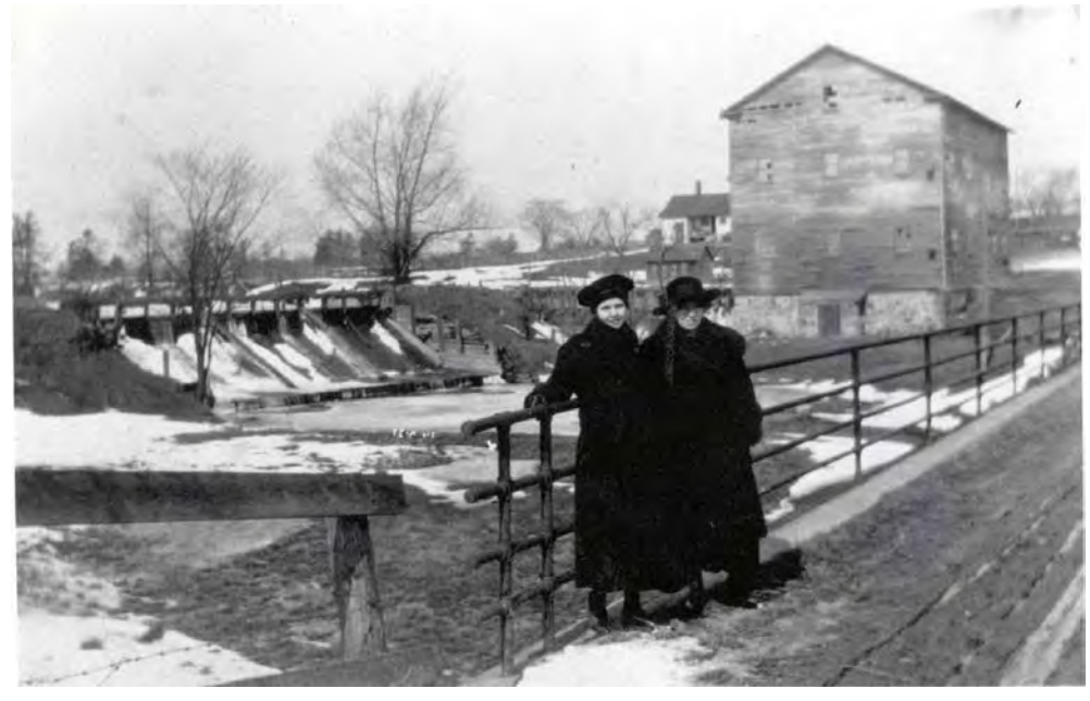
The Buttonville Heritage Conservation District boundaries focus on the core of the hamlet that grew up around the local milling industries. Casella #22

Council endorsed the boundaries of the Buttonville Heritage Conservation District in January 2006, as illustrated on Figure 2.