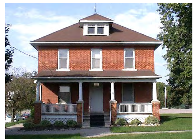
The Mill House at 9064 Woodbine Avenue was originally a 1-1/2 storey Georgian house, associated with the Venice Mill.