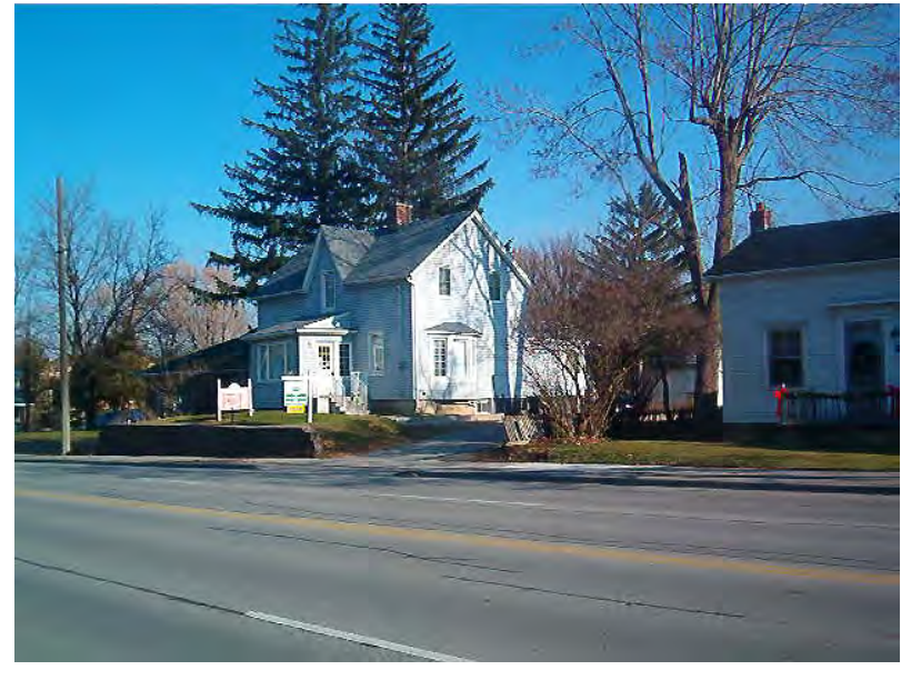
Heritage Buildings on Woodbine Avenue have been converted to commercial uses.

The majority of the heritage buildings are residential, but other types are included in the district: shops, town barns, a smithy and a community meeting hall.