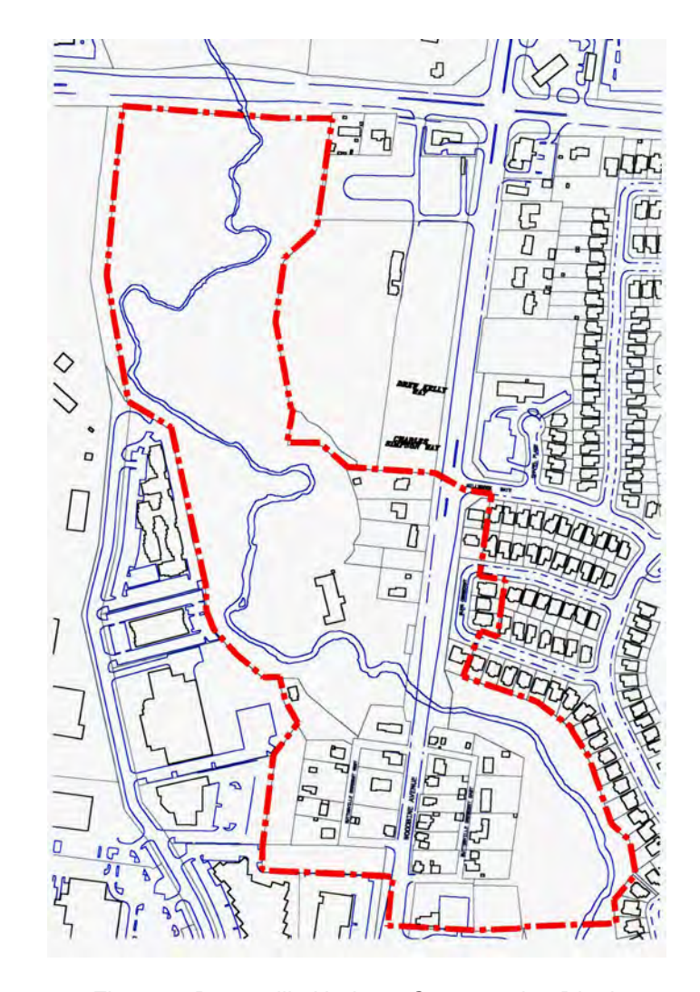
Figure 2: Buttonville Heritage Conservation District