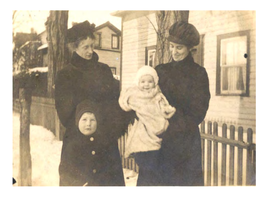
In front of the original house at 8971 Woodbine Aveue, with the houses at 8977 and 8985 in the background. Casella #44