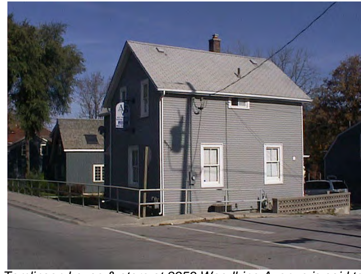
The Tomlinson house & store at 8953 Woodbine Avenue is said to be Buttonville's first shop.

Although the widening of Woodbine Avenue has changed the spine of the hamlet, the District retains its original layout and many heritage buildings and sites, including outbuildings, remain largely intact. The historical context of the river-driven mills that brought the hamlet into existence lies in the valley lands along the Rouge River.