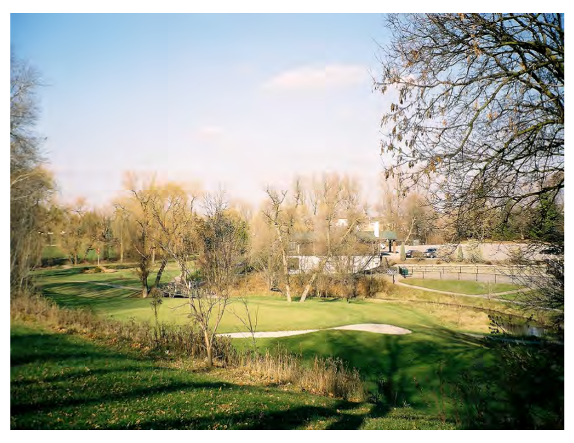
The former site of Buttonville's Mill Pond is a significant green space.