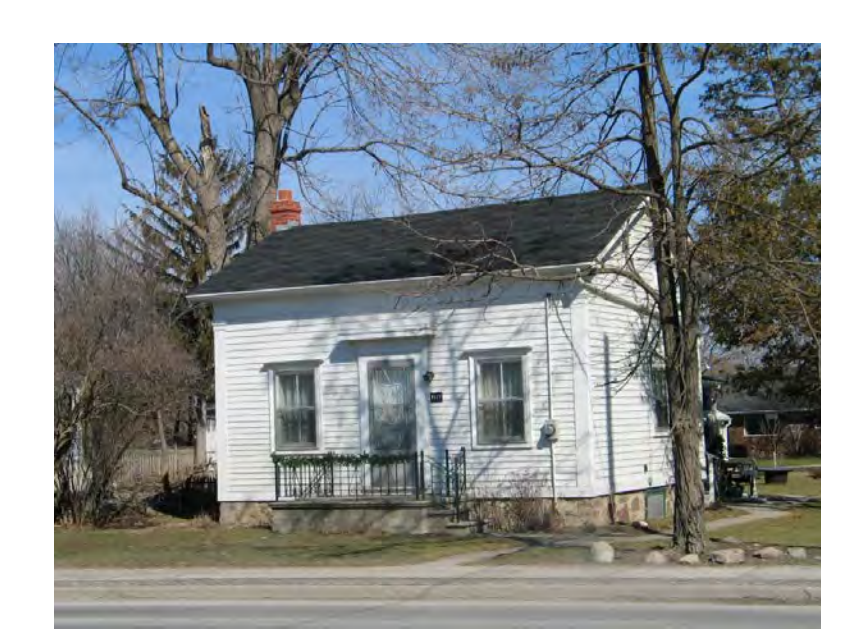
The Button Family House at 8977 Woodbine Avenue is the best-preserved pre-Confederation building in Buttonville.