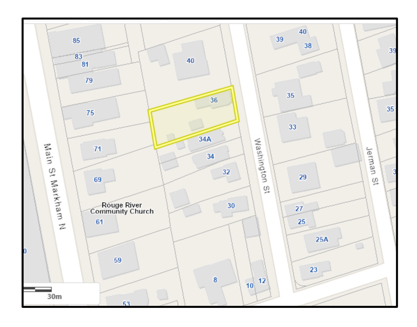
FIGURE 1- LOCATION MAP