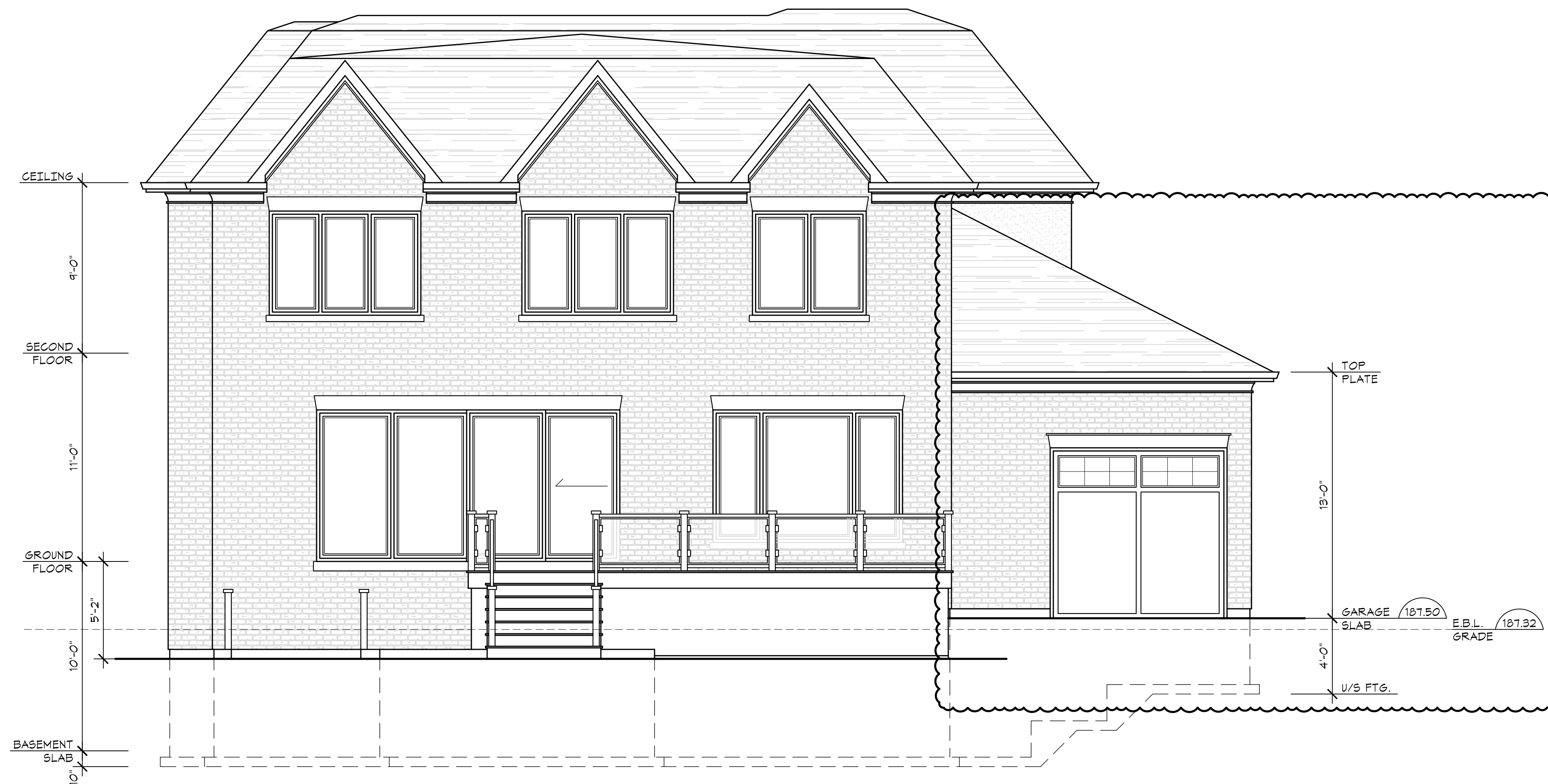
REAR (WEST) SIDE ELEVATION

GENERAL NOTES: ALL CONSTRUCTION IS TO CONFORM TO SECTION "4" OF THE ONTARIO BUILDING CODE (LATEST EDITION). CONTRACTOR SHALL CHECK AND VERIFY ALL NOTES AND DIMENSIONS. DO NOT SCALE DRAWINGS. OWNER / CONTRACTOR / DESIGNER IS RESPONSIBLE TO RE-CLAIM AND DESTROY ALL PREVIOUS AND UN-REVISED COPIES OF THIS DRAWING. THESE DRAWINGS ARE THE PROPERTY OF THE GREGORY DESIGN GROUP AND / OR ITS CLIENTS ONLY. BUILDING PERMITS TO BE OBTAINED PRIOR TO COMMENCING CONSTRUCTION.