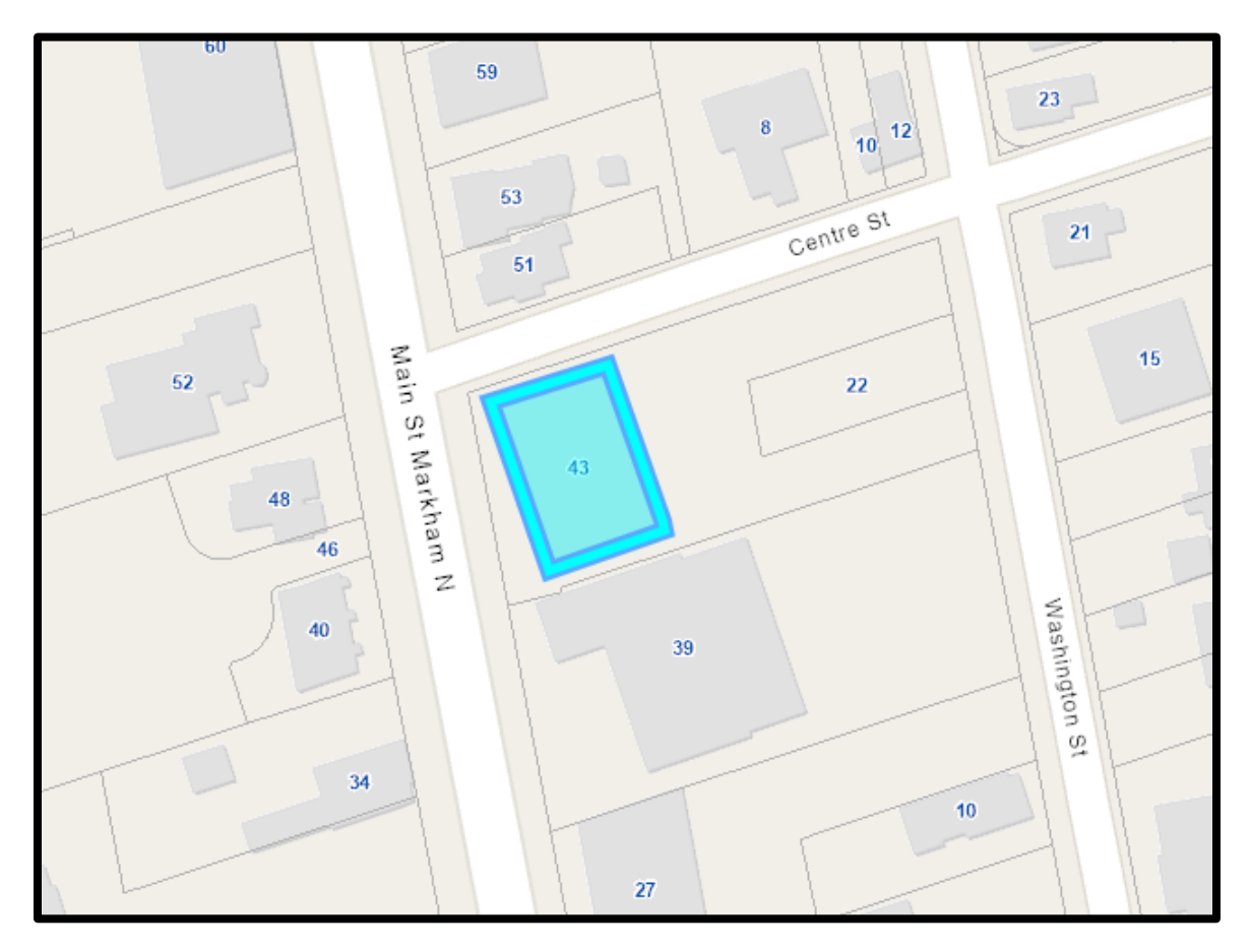
FIGURE 1 – LOCATION MAP