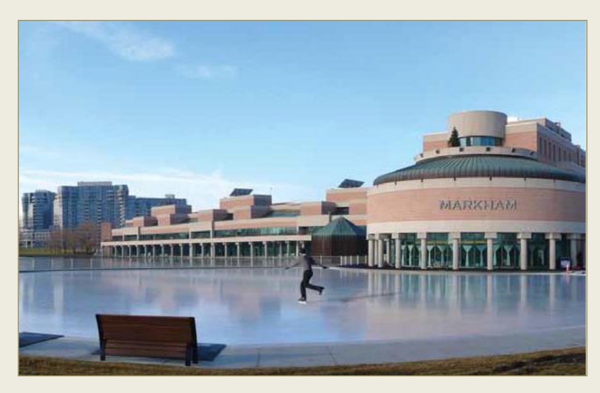
Founded more than 200 years ago, Markham proudly became a City on July 1, 2012.