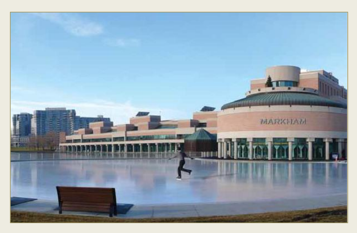
Founded more than 200 years ago, Markham proudly became a City on July 1, 2012.