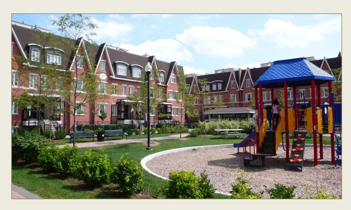
Successful urban design contributes to the development of vibrant public spaces.