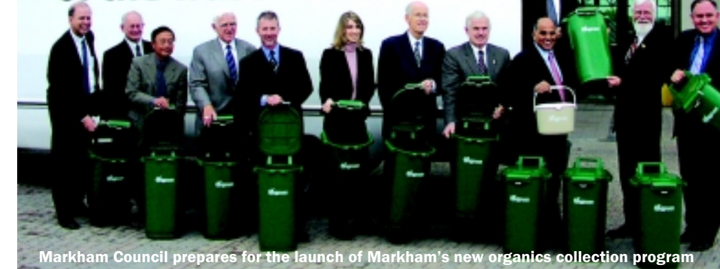
Markham Council prepares for the launch of Markham's new organics collection program

Get kitchen organics out of the waste stream.