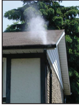
Smoke exiting a downspout

If you have questions about this program, or the investigation and testing, contact us: customerservice@markham.ca or 905-475-4862