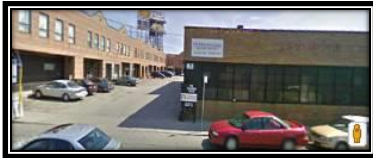
Strip mall location

The proceeds from ReStore support the programs of Habitat for Humanity. All materials sold by ReStore were donated for that purpose—often by contractors with excess supplies, demolition crews salvaging reusable materials, retail stores with overruns, or the general public. In addition to raising funds, ReStore helps the environment by diverting thousands of tons of usable materials away from landfills. Currently there are 62 ReStores established across Canada.