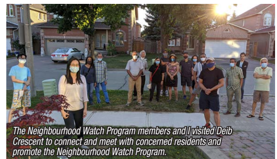
The Neighbourhood Watch Program members and I visited Deib Crescent to connect and meet with concerned residents and promote the Neighbourhood Watch Program.