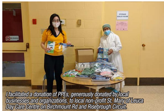
I facilitated a donation of PPEs, generously donated by local businesses and organizations, to local non-profit St. Mary of Leuca Day Care Centre on Birchmount Rd and Risebrough Circuit.