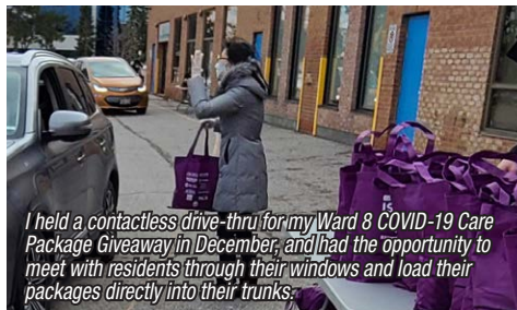
I held a contactless drive-thru for my Ward 8 COVID-19 Care Package Giveaway in December, and had the opportunity to meet with residents through their windows and load their packages directly into their trunks.

As we are in the midst of the second wave of COVID-19, PPEs are absolutely indispensable. They can be difficult to find, and adding expense to families already having a heavy