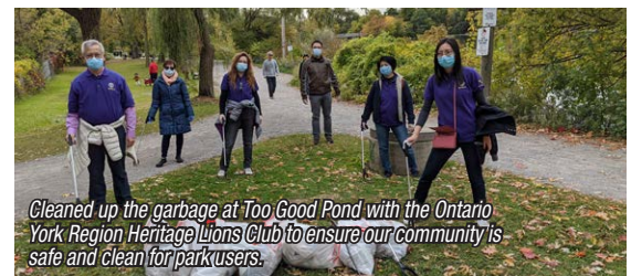
Cleaned up the garbage at Too Good Pond with the Ontario York Region Heritage Lions Club to ensure our community is safe and clean for park users.