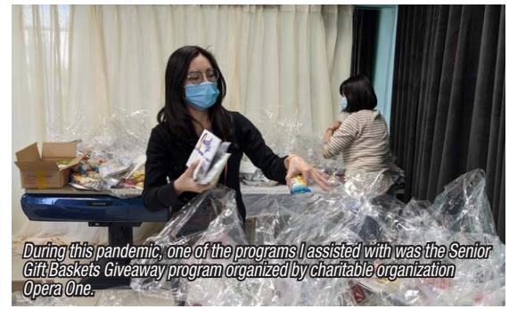
During this pandemic, one of the programs I assisted with was the Senior Gift Baskets Giveaway program organized by charitable organization Opera One.

Use Markham's Winter Maintenance App on Markham.ca/winter to find out what type of road you live on.