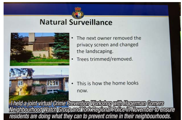
I held a joint virtual Crime Prevention Workshop with Hagerman Corners Neighbourhood Watch Group and York Regional Police in November to ensure residents are doing what they can to prevent crime in their neighbourhoods.

In this pandemic, the way we connect has changed drastically. All meetings and events have gone virtual. In an effort to keep our residents informed and connected, I held a joint Crime Prevention Workshop with the Hagerman Corners Neighbourhood Watch Group and York Regional Police in November to ensure our residents are not only staying healthy, but also learn to protect themselves from any potential crimes in the neighbourhood. If you would like to watch the Crime Prevention Workshop, scan the QR Code below.