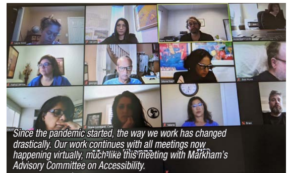
Since the pandemic started, the way we work has changed drastically. Our work continues with all meetings now happening virtually, much like this meeting with Markham's Advisory Committee on Accessibility.