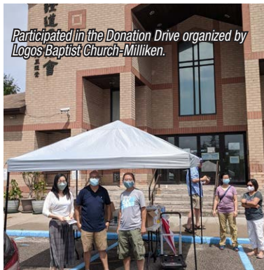
Participated in the Donation Drive organized by Logos Baptist Church-Milliken.