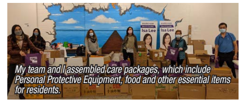
My team and I assembled care packages, which include Personal Protective Equipment, food and other essential items for residents.

financial burden in the pandemic; hence, I decided to run a COVID-19 Care Package Giveaway this year. Many businesses and organizations are struggling in this challenging climate. This care package includes a number of coupons and flyers to help promote these local business, non-profit organizations and service programs in our community.