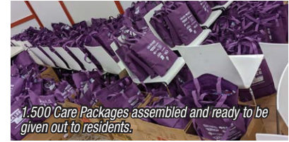
1,500 Care Packages assembled and ready to be given out to residents.

With the support of 105 Gibson Centre, I was able to organize a drive-thru pick-up in December to give out a portion of these care packages. After that, I also delivered a care package to each unit at Hagerman Corners and Tony Wong Place, two affordable housing buildings in Ward 8.