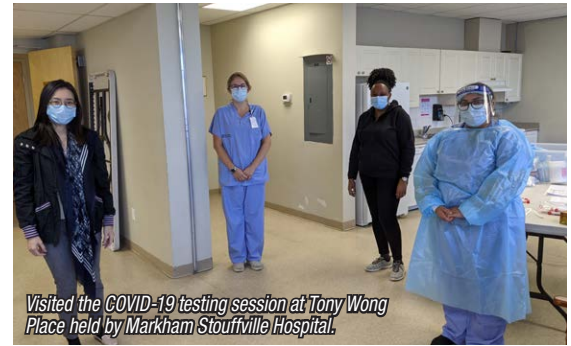
Visited the COVID-19 testing session at Tony Wong Place held by Markham/Stouffville Hospital.