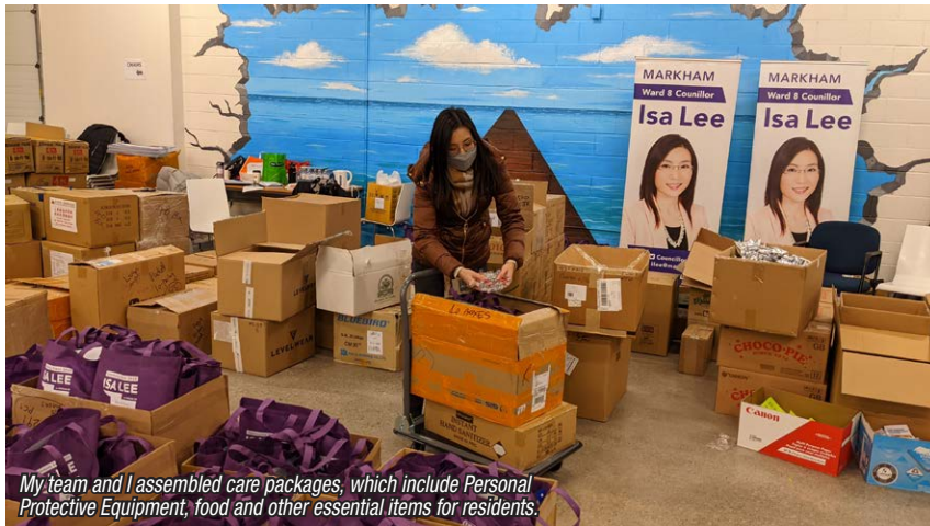
My team and I assembled care packages, which include Personal Protective Equipment, food and other essential items for residents.

The year of 2020 has been filled with unprecedented challenges. It has taught us to adapt and make the best out of any scenario we may be faced with. While this year has been difficult for many, it has also united us in a way never seen before and our community has become stronger than ever.